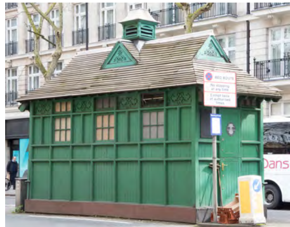
Photographs and text by Mike White

Or this cabmen's shelter outside the V&A?